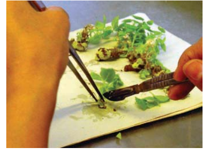
Figure 5: Working with Paulownia in vitro.

The use of in vitro propagation techniques provides a supply of healthy, homogenous planting material for Paulownia. Trees planted from seed often show an altered growth habit and may be more susceptible to pests and diseases. We use only primary and axillary shoot meristems as explants for our in vitro cultured Paulownia plants in order to ensure true clonal propagation. Our research has shown that the best growth is achieved when the composition of the growth medium is adjusted for both the variety and the stage of growth.