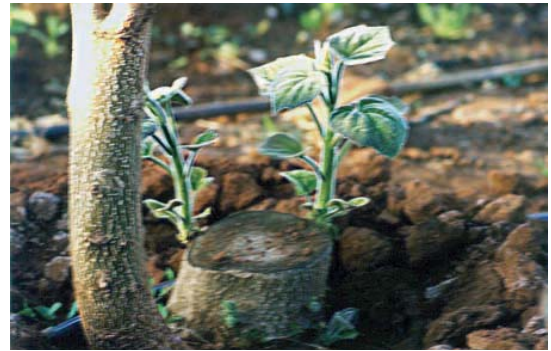
Figure 7: A coppiced trunk with new shoots.

Coppicing is the process of cutting a tree back to ground level in order to promote the formation of a new shoot. Paulownia is a prolific shooter; it is therefore recommended that trees be coppiced, preferably during the second year. Trees should be coppiced in the late spring, just before the beginning of the growing season. Short trunked seedlings or seedlings with poorly formed trunks should be cut just above the third bud during spring of the second year, just before the emergence of new leaves; a new, straight, well-formed trunk will shoot from the lower buds. Allow several of the buds to grow out before selecting the best one.