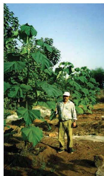
Figure 9: Two month old Paulownia. Note the large leaves that form during the first year.

Source: Leaf analysis by Industry Institute