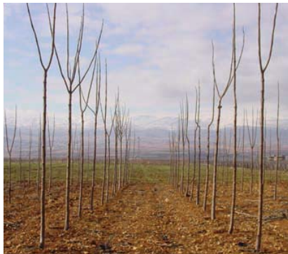
Figure 8: Trees pruned in the growing season; only the crown branches remain in winter. Bekkaa Valley, Lebanon; December 2001.

Pruning should begin in the second or third year and should be performed throughout the growing season as new branches emerge. Unnecessary lateral branches should be removed; the branches of the crown, however, should not be cut during the year of their emergence, as they will form the sympodial extension of the trunk. Only the first 7-8 meters of the stem need to be kept clear of branches; after this the canopy can be allowed to assume its natural shape.