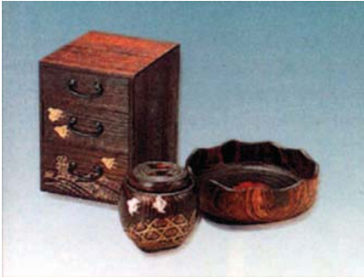
Figure 10: Some handicrafts made from Paulownia.