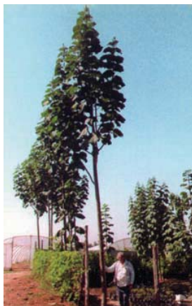
Figure 4: A one year old tree in our nursery.

The Paulownia tree is extremely hardy; it has a broad range of temperature tolerance and has been known to grow at altitudes of up to 2,000m. Under optimal conditions, a 5-6m increase in height can be expected in the first growing season and an increment of 3-4cm in diameter at breast height annually. Trunk extension in Paulownia is sympodial; the rapid growth of the lateral branches, however, gives it the appearance of a monopodial growth pattern.