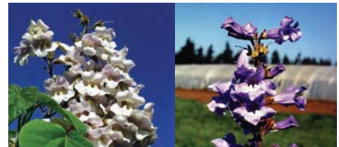
Figure 3: Paulownia flowers. Flower color varies with variety; the range is from light to dark purple.

Paulownia is a fast-growing deciduous hardwood with gray-brown lenticillate bark. The leaves have long petioles and an opposite arrangement; juvenile leaves can be as large as 80cm, with a serrate margin, while mature leaves are smaller and have a smooth, wavy margin. The undersurface of the leaves is covered with a dense layer of fine hairs. The inflorescence is a pedunculate or sessile cyme of 2-5 flowers; the fragrant, purplish white flowers have a large, two-lipped corolla, with two lobes on the upper lip and three on the lower. Paulownia is entomophilous and can be cross-pollinated to produce numerous small, ellipsoid, membranaceous seeds with striate wings.