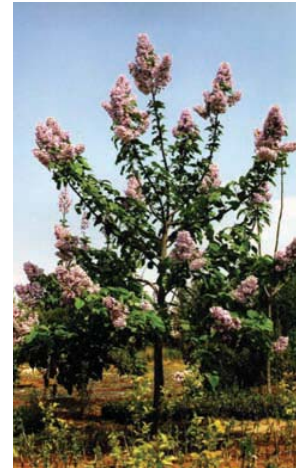
Figure 2: A Paulownia tree in bloom. Lis is an ornamental variety; the open canopy is not suitable for timber production.

It was introduced into the United States in the 1800s when Paulownia seeds, which had been used as packing material for Chinese dinnerware, were released into the wild, where they flourished. These feral Paulownia growths were discovered by the Japanese in the 1970s and have since become the focus of a multi-billion dollar export project.