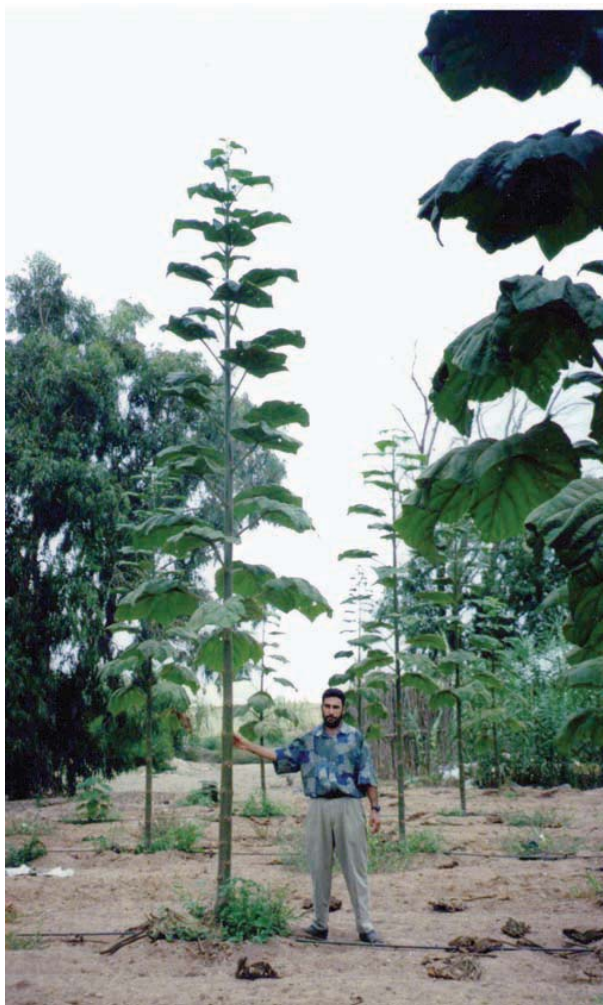
September 1999. The melon has been removed and the Paulownia is now several meters in height.