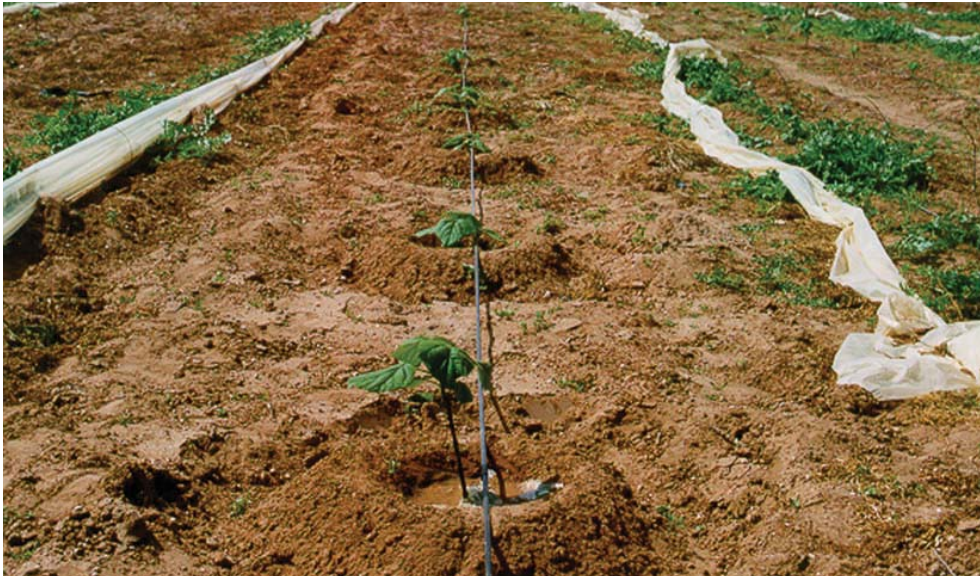
March 1999. Paulownia and melon being planted.