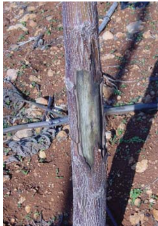
Figure 6: Grazing damage to trunk.

Paulownia can survive between latitudes 45°N and 45°S and at altitudes of up to 2,000m. Although the tree can withstand temperatures between -20°C and +40°C, optimal conditions for growth are between 24°C and 29°C. In regions where there is a significant seasonal variation in temperature, it is advisable to wrap young trees in grass during the winter (to protect the bark from freeze-damage) and to paint them during the summer (to protect the bark from sun-scald). Young Paulownia trees are very tall but may not have yet developed an extensive root system to provide anchorage; strong winds can cause breakage or inclined stems, which should be straightened out, propped and mounded.