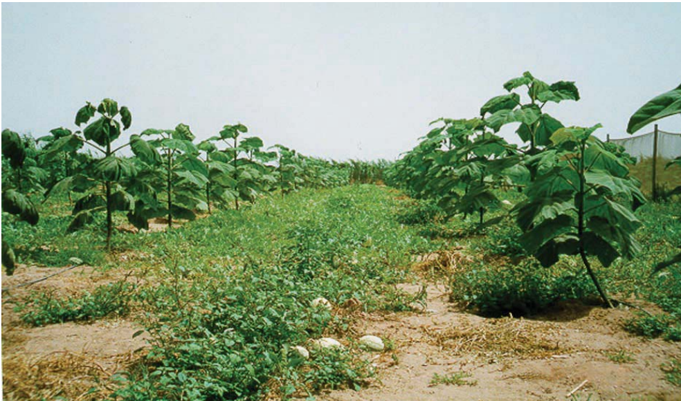
June 1999. Paulownia being intercropped with melon.